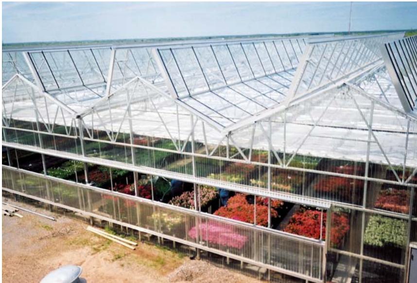
Optional Side Venting: Exterior Guillotine shown on endwall of Dual Atrium